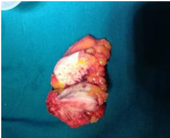
Figure 1. Cut section of mass of 5*5*3.5 cm showing fibro fatty tissue

towards the right side. The swelling was firm in consistency, fixed to the surrounding tissue, which was non-tender. Per speculum and bimanual examination revealed no abnormality. Ultrasonography showed right-sided, surface occupying lesion in the subcutaneous plane measuring 2.5 × 2.2 cm with an impression of scar endometriosis with no evidence of pelvic endometriosis. Fine needle aspiration cytology of the swelling revealed scar endometriosis. The mass (Figure 1) was excised completely without any complication and sent for histopathological examination, which revealed scar endometriosis (Figure 2).