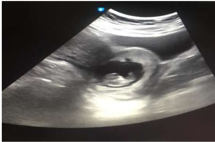
Figure 1. Nine weeks of pregnancy in cervical area with fetal heart rate