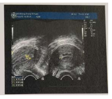
Figure 1. Ultrasound on 15<sup>th</sup> March 2021 showed an anteverted uterus and enlarged right and left ovaries with multiple peripherally enlarged follicles

A slightly strong echo was reported at the upper right edge of the uterine cavity, measuring 0.70x0.54x0.53 cm with an unclear border and no significant ovarian stromal blood flow. The right ovary measuring 3.09x2.39 cm was seen with 1 enlarged follicle sized 2.20 cm which was poorly developed, and another 2 small follicles. The left ovary measuring 2.53x1.15 cm was seen with 1 small follicle. The ultrasound screening suggested further investigation after menstrual bleeding on the strong echogenicity in the uterine cavity.