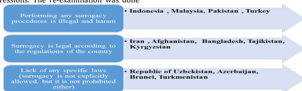
Figure 2. Legal status of surrogacy in 13 Asian Islamic countries

Based on the search strategy, in the first stage 5 of 63 articles were excluded due to being repeated and 30 due to lacking inclusion criteria, resulting in 28 eligible articles. Based on the findings of these articles, comparative legal frameworks of surrogacy in 13 Asian Islamic countries are as follows (Figure2). According to the results there are three groups of countries including 1) Countries where performing any surrogacy procedures is illegal and haram 2) countries in which surrogacy is legal according to the regulations of the country and 3) countries that have no specific laws I e. surrogacy is not explicitly allowed, but it is not prohibited either (Figure 2).