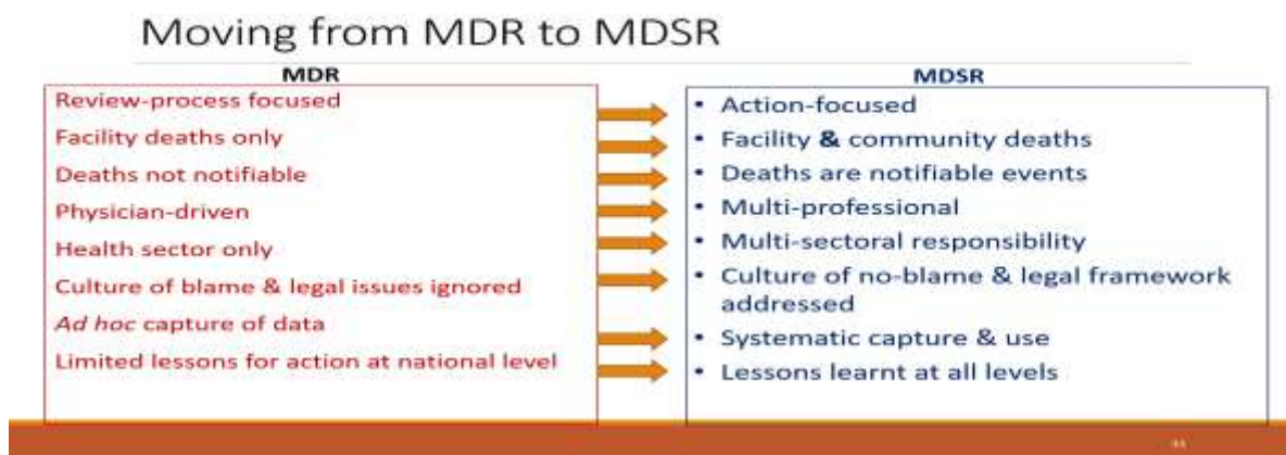
Figure 2. Transition from Maternal Death Review to Maternal Death Surveillance and Response

The limitations of pre-MDSR strategies were (i) irregular underreporting of maternal mortalities due to the suboptimal quality of reports (e.g., discrepancies, blank columns, and