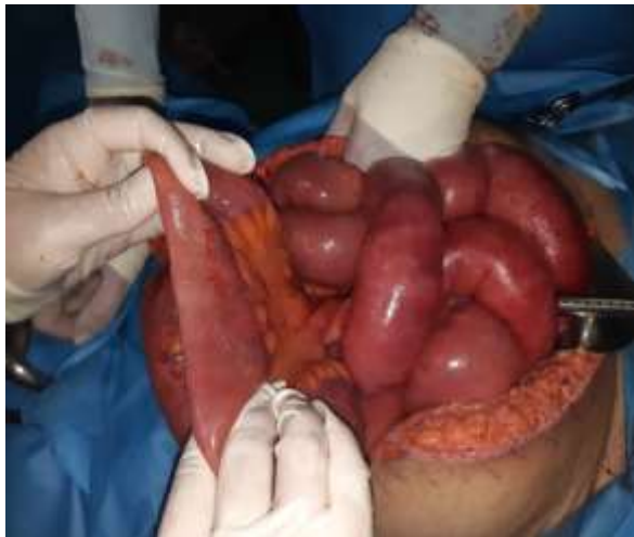
Figure 2. Appearance of severe bowel distension

evacuation of intestinal contents from the oesophagus to the rectum.