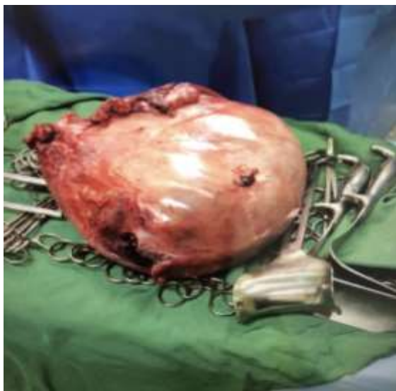
Figure 3. Macroscopic and microscopic patterns of hysterectomy

This procedure was carried out by a general surgeon very gently and carefully and continued until feces and gas were completely removed from the intestines. Ultimately, the normal appearance of total intestines was observed (Figure 3).