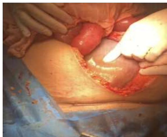
Figure 1. Laparotomy showing enlarged soft uterus as equivocal 36 weeks of pregnancy

Ray was normal. According to abdominal ultrasonography, the uterine size was 130×330 mm with myometrium thickening, and gas was detected in the uterine cavity. The possible diagnosis was uterine atony and metritis. Abdominal flat X-ray and computed tomography (CT) scan demonstrated partial bowel obstruction only in small bowels. Emergency laparotomy was performed due to non-response to medical treatment. During laparotomy, enlarged soft uterus as equivocal 36 weeks of pregnancy was observed with a very pale appearance. Despite the reassessment of intracavity and removal of all stitches of CS, no reason to uterine distention was found. In addition, the left ovarian and fallopian tube were gangrened (Figure 1).