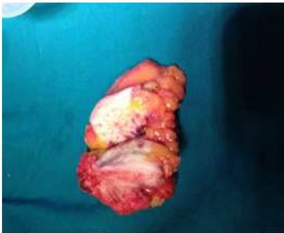
Figure 1. Cut section of mass of 5*5*3.5 cm showing fibro fatty tissue

3 cm was felt at the edge of the caesarean scar towards the right side. The swelling was firm in consistency, fixed to the surrounding tissue, which was non-tender. Per speculum and bimanual examination revealed no abnormality. Ultrasonography showed right-sided, surface occupying lesion in the subcutaneous plane measuring 2.5 × 2.2 cm with an impression of scar endometriosis with no evidence of pelvic endometriosis. Fine needle aspiration cytology of the swelling revealed scar endometriosis. The mass (Figure 1) was excised completely without any complication and sent for histopathological examination, which revealed scar endometriosis (Figure 2).